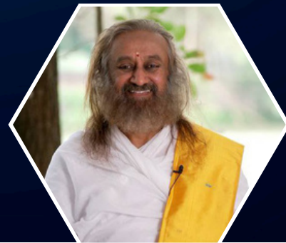
Sri Sri Ravi Shankar