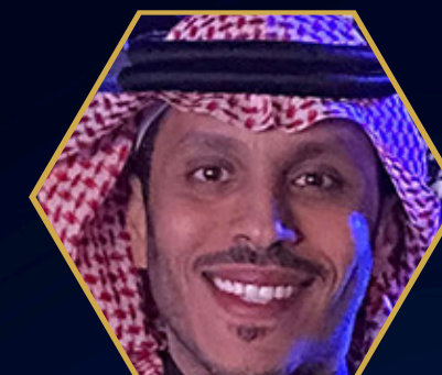
Sultan bin Fahd bin Salman Al Saud