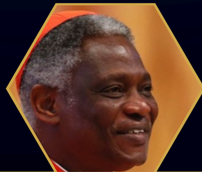
Cardinal Peter Turkson

CEO of Seier Capital, Chairman of the Concordium Foundation